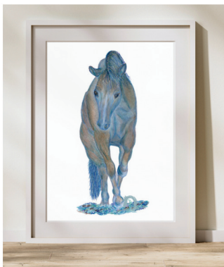
available in 5" x 7" ~ 8" x 10" ~ 11" x 14"

StillWaterTrail is the color turquoise blue and the blue topaz gem ~ inspired by Raine, a very special horse, walking by quiet streams and trails