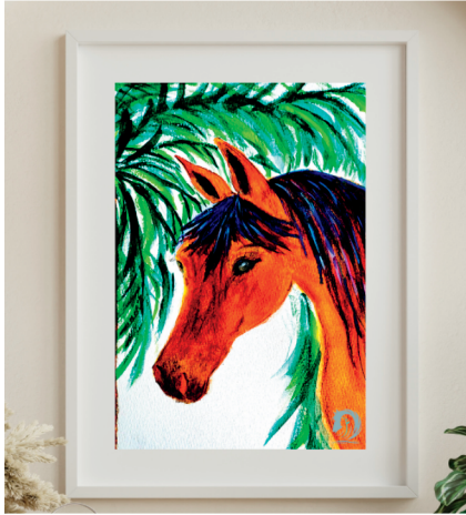
available in 5" x 7" ~ 8" x 10" ~ 11" x 14"

Inspired by nature and beauty in tropical paradise, this stunning, exquisite pony encourages you to be still in the moment to radiate your true beauty, balance and harmony while living your best healthy life.