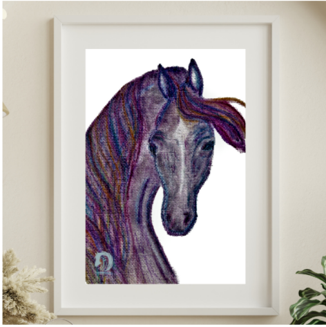
available in 5" x 7" ~ 8" x 10" ~ 11" x 14"

Inspired by nature, this mysterious whimsical pony's colorful curious magic illuminates your way with confidence, trust and discovery to your best healthy life.